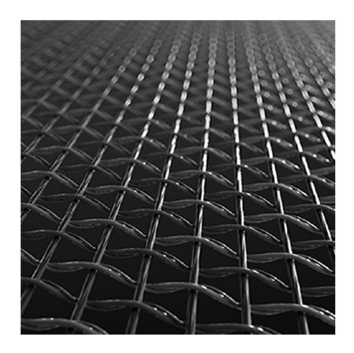
Breathable, not muggy, sedentary, not sweating